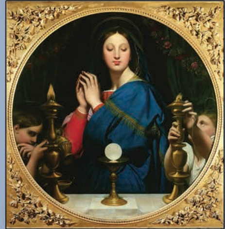
Image: Jean-Auguste Dominique Ingres, The Virgin Adoring the Host 1854, Oil on canvas, Musée d'Orsay, Paris